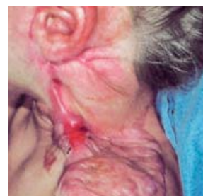
Hypertrophic & Keloid scars